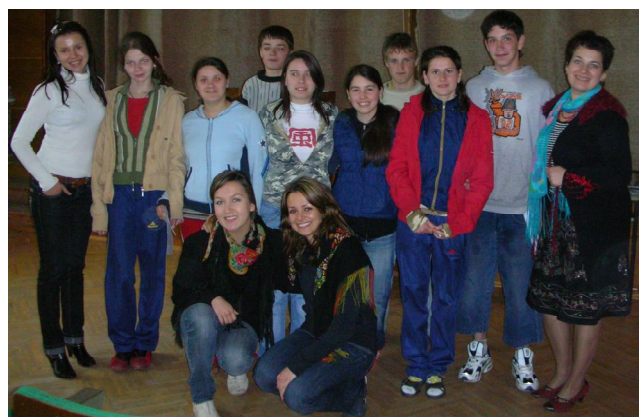
Seminar “Human Trafficking Awareness Project” with volunteers from Help Us help the Children Fund