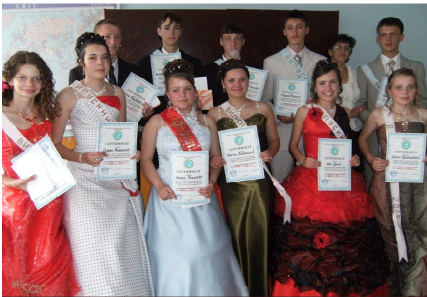
Orphan Graduates 2008 of the Koropets school