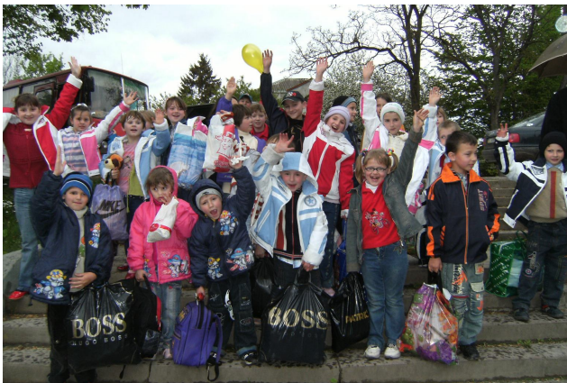
Charitable action “Bring happiness to a child in a family”