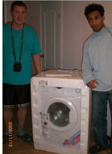
Washing machine to social dormitory for orphans