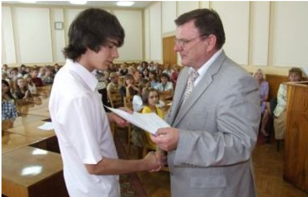
Giving rewards to talented orphans