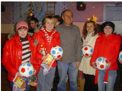
Balls to orphans from Australia