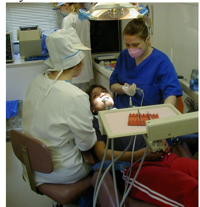
Orphans’ Dental care at Medical Clinic on wheels, /Fund Gift of Life