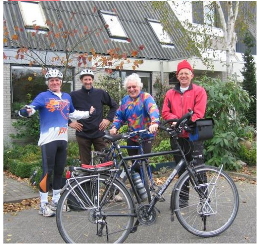
WALO (Holland) team at summer camp