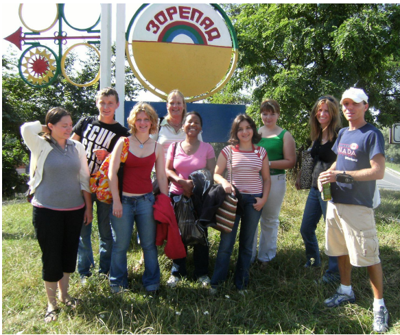
Volunteers at summer camp 2008