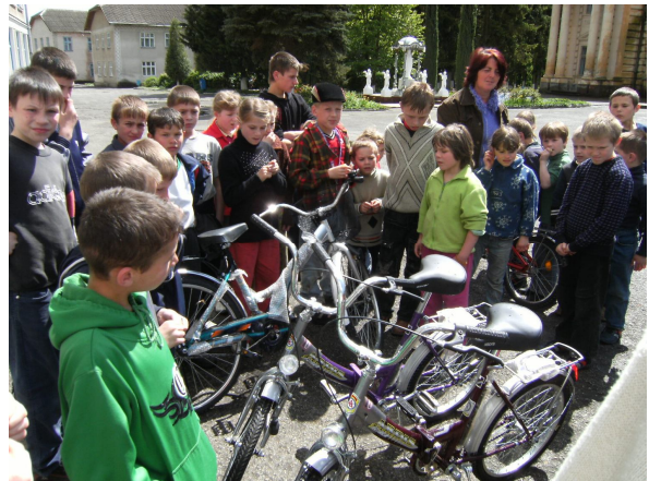
Easter Action “Bicycles to pupils at orphanages”