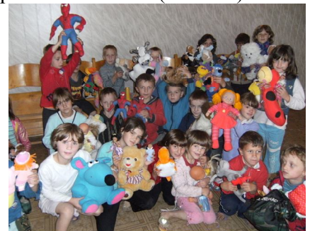
Stuffed animals from children of Spain