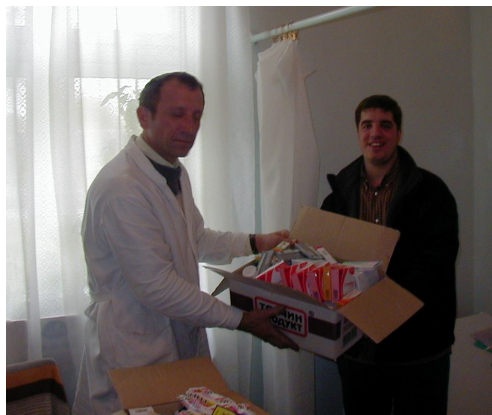
Medical aid to the Koropets orphanage